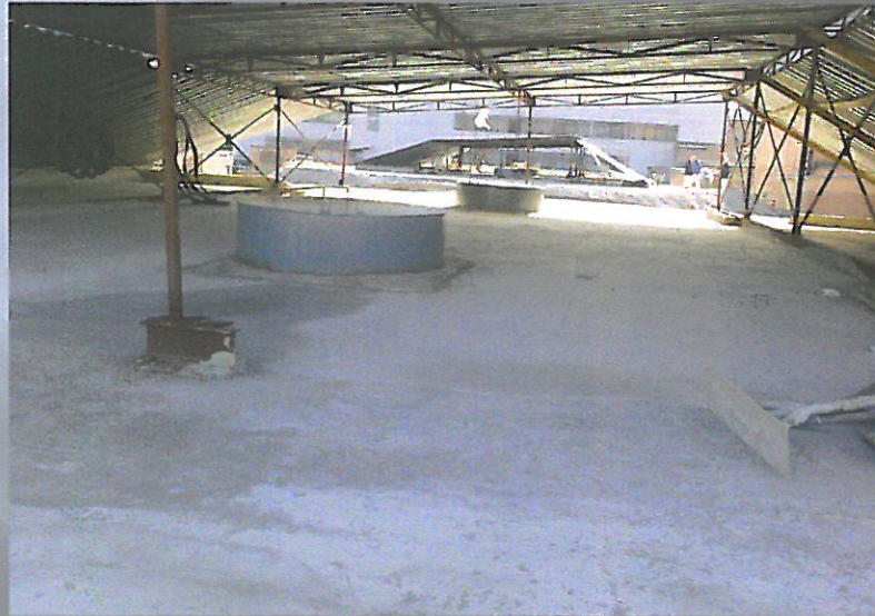
Tank remediation works complete